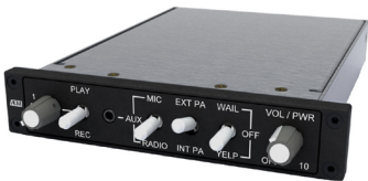
LSC22 Series Loudspeaker Controller