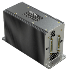
LSA800 Loudspeaker Amplifier